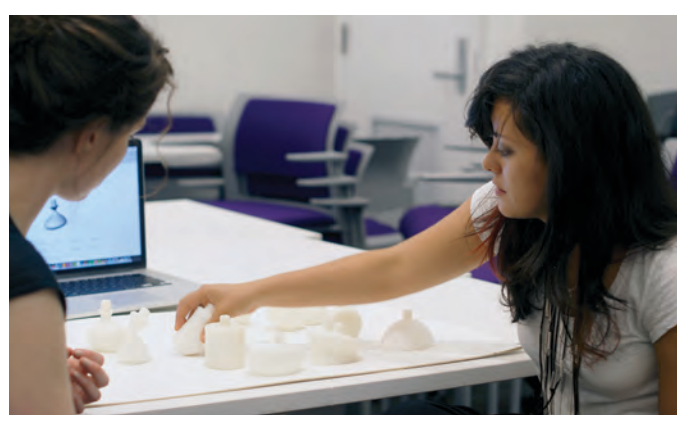
→ A user study participant evaluating the emotive forms on both an online survey and by handling 3D-printed models.