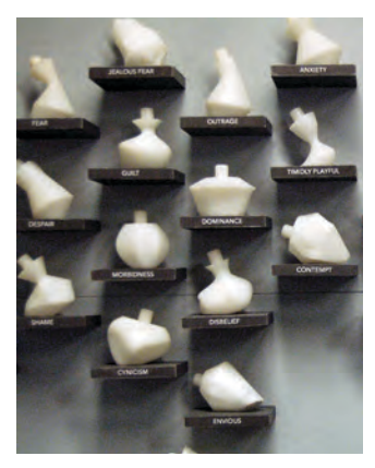
→ A small selection of the many emotive forms generated by the EmotiveModeler that were used in the user studies.

DOI: 10.1145/2830315 COPYRIGHT HELD BY AUTHORS