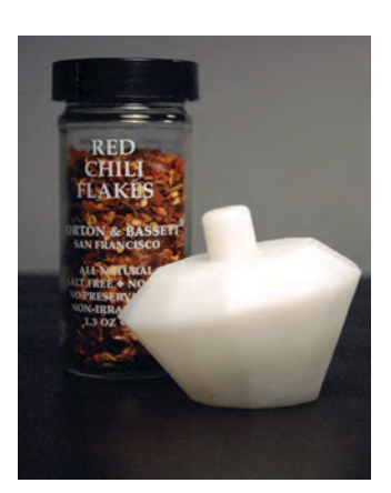
→ Transforming your simple cylindrical chili pepper spice bottle into an evocative angular "fiery" form.

What was the biggest surprise in making this? Initially motivated by how the EmotiveModeler could aid novice designers, we were pleasantly surprised to find that professional