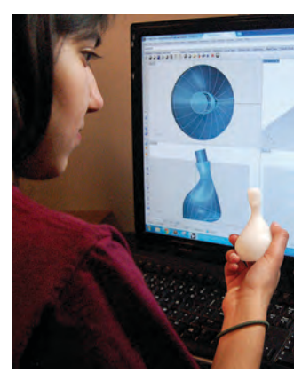
→ The EmotiveModeler in use by a novice designer.