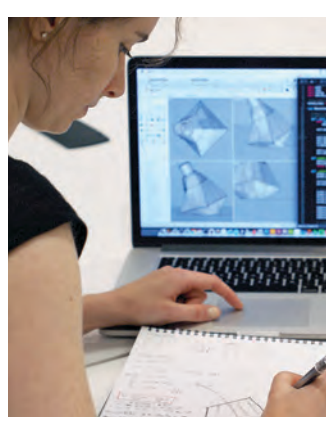
→ Pip Mothersill experimenting with the design parameters of emotive forms.